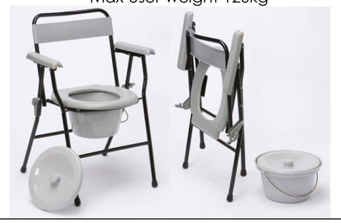
Duo Bunk - Changing bed